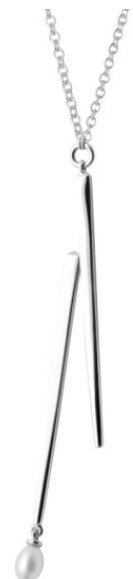
Chopstick necklace in 925